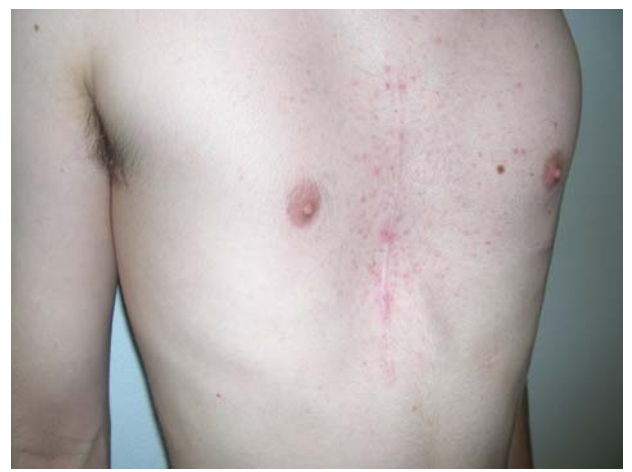
Figure 1. Illustration of pectus deformity and myocardial translocation. Pectus deformity with obvious leftward translocation of the myocardium which concurs with the description by Malek and Fonkalsrud (2004), and Garusi and D'Ettorre (1964) of translocation of the myocardium to the mid-axillary line slightly below the armpit. Scar at midline is due to repair of the sternal fracture, not pectus repair.

reporting exercise limitation are common (Shamberger, 2000).