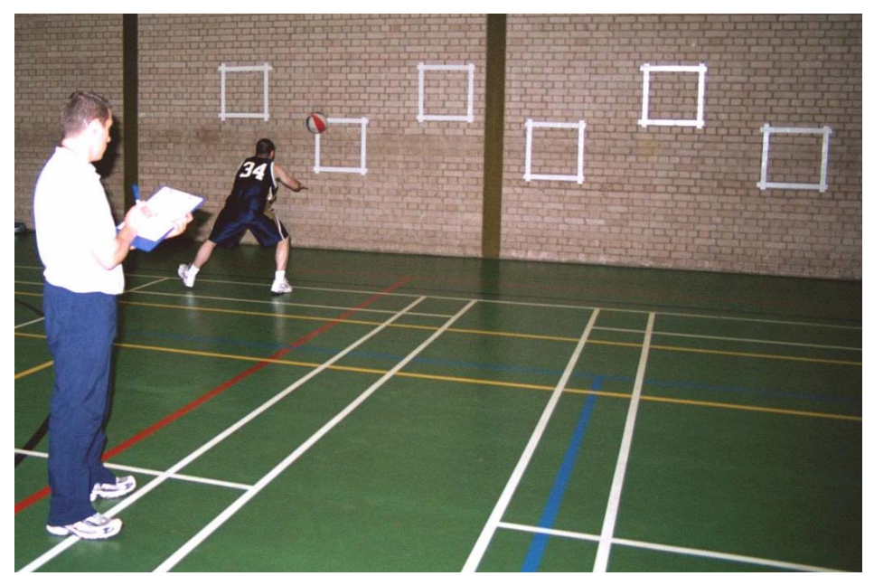
Figure 4. Participant Performing the AAHPERD (1984) Basketball Passing Test.

The test score was obtained by totalling all the points scored over the duration of the thirty-second test.