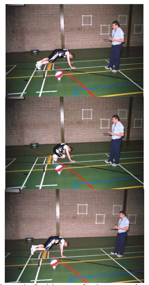
Figure 1. Participant performing squat thrusts (Photographer: Ali Maghoo).

different team sports at collegiate level. Their mean age, height and weight were: 23.30 \pm 1.05 yrs, 1.76 \pm 0.03 m, and 80.50 \pm 5.64 kg respectively. Ten expert basketball players also participated in the study and consisted of a mixture of national division one and two players. Their mean age, height and weight were: 22.50 \pm 0.41 yrs, 1.83 \pm 0.20 m, and 87.80 \pm 4.02 kg respectively. Following institutional ethics approval, informed consent was provided by each participant after being fully informed of the nature and demands of the study.