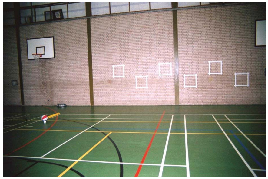
Figure 3. Set-up of the AAHPERD Basketball Passing Test.