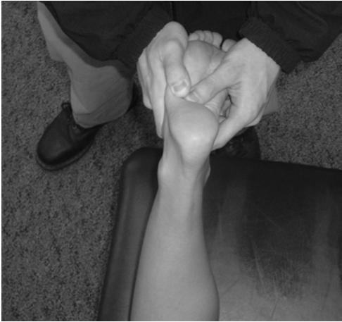
Figure 6b. The knee is then passively extended as the ankle is plantar flexed with slight supination of the subtalar joint