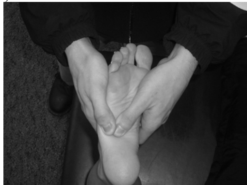
Figure 6a. "Cuboid Whip" Manipulation. The manipulation is performed with the patient in the prone position, starting with the knee flexed to 70° - 90° and the ankle near neutral.