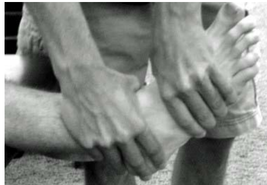
Figure 5. Midtarsal Supination Test. To perform this test, the clinician stabilizes the subtalar joint and ankle with the right (proximal) hand, while the left (distal) hand applies the supination motion (inversion, plantar flexion, and forefoot adduction).

mobility due to guarding of the patient and testing for hypermobility versus hypomobility does not provide any additional information aiding in the diagnosis (Jennings and Davies, 2005). Therefore, a positive test is indicated by pain or reproduction of the patient's symptoms (Marshall and Hamilton, 1992). Testing themidtarsal joint, using themidtarsal adduction test (Figure 4) and themidtarsal supination test (Figure 5) may also replicate the patient's symptoms as well (Blakeslee and Morris, 1987; Jennings and Davies, 2005). In addition, Jennings and Davies (2005) have stated pronation and abduction, which compress the structures involved in this syndrome, may occasionally provoke the patient's symptoms. Gait evaluation and functional testing are beneficial and should also be performed with patients who present with cuboid syndrome symptoms as a reproduction in the patient's symptoms may be noted (Jennings and Davies, 2005). All of the previously mentioned tests were documented in the literature and will aid the clinician in accurately diagnosing cuboid syndrome. However, other, more commonly, administered special tests are not to be neglected as they are required for a differential diagnosis.