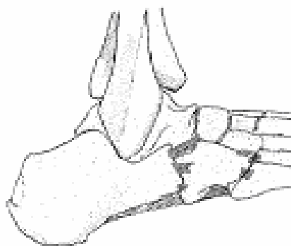
Figure 1. The dorsal and plantar ligaments of the cuboid and its articulations

The calcaneocuboid and talonavicular joints function together about their respective axes to create the midtarsal joint or Chopart's joint (Blakeslee and Morris, 1987). The shape and position of the cuboid is also influenced by an extrinsic muscle tendon, the peroneus longus (Blakeslee and Morris, 1987). This muscle originates on the upper one-third of the fibula. It then travels distally down the shaft of the fibula and posteriorly around the lateral malleolus continuing to travel in a plantar lateral direction until the tendon reaches the cuboid. Here the path of the tendon then changes directions and travels anteromedially through the cuboid's peroneal groove and inserts on the lateral base of first metatarsal and first cuneiform.