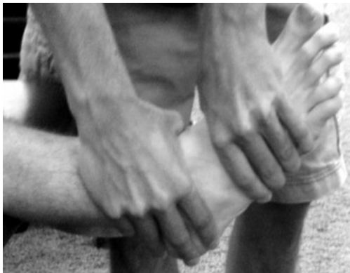
Figure 4. Midtarsal Adduction Test. To perform this test, the clinician stabilizes the ankle and the subtalar joint with the right (proximal) hand, while the left (distal) hand applies the adduction force (arrow).

Normal active and passive range of motion at the foot and ankle may be decreased when compared bilaterally (Marshall and Hamilton, 1992; Mooney and Maffey-Ward, 1994). Pain may be elicited during passive inversion and also during active and resistive plantar flexion and eversion (Blakeslee and Morris, 1987; Mooney and Maffey-Ward, 1994; Newell and Woodle, 1981). Resisted inversion, resulting in pain along the peroneus longus as it passes underneath the cuboid, has also been documented as diagnostic procedure used in the evaluation of cuboid syndrome (Subotnick, 1989).