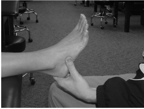
Figure 3. Palpation directly over the dorsolateral aspect of the cuboid bone will elicit pain in cuboid syndrome. This aspect of the cuboid can be palpated just proximal to the styloid process of the 5 th metatarsal and distally of the peroneal tubercle of the calcaneus.

Normal active and passive range of motion at the foot and ankle may be decreased when compared bilaterally (Marshall and Hamilton, 1992; Mooney and Maffey-Ward, 1994). Pain may be elicited during passive inversion and also during active and resistive plantar flexion and eversion (Blakeslee and Morris, 1987; Mooney and Maffey-Ward, 1994; Newell and Woodle, 1981). Resisted inversion, resulting in pain along the peroneus longus as it passes underneath the cuboid, has also been documented as diagnostic procedure used in the evaluation of cuboid syndrome (Subotnick, 1989).