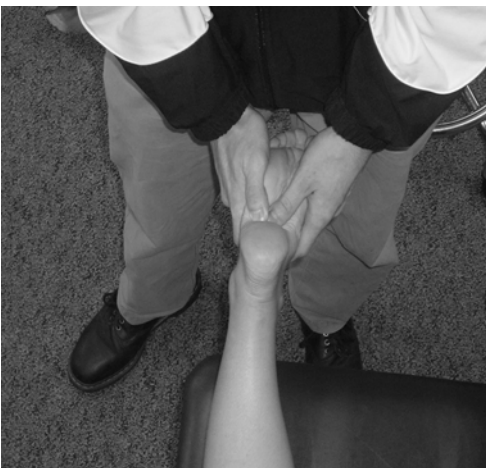
Figure 6c. A thrust force is applied using both thumbs on the plantar aspect of the cuboid.

Theoretically, the cuboid manipulation is thought to realign the disruption of the calcaneocuboid joint (Marshall and Hamilton, 1992; Newell and Woodle, 1981). The realignment of this joint is only speculative and the theory yet to be confirmed (Jennings and Davies, 2005). However, the cuboid manipulation may still alter the stresses on the bony and soft tissues that surround the cuboid (Maigne and Vautravers, 2003). Manipulation done to other areas in the body has shown to provide an analgesic effect which was most likely due to the gate theory of pain as well as the elevation in plasma beta endorphin levels (Melzack and Wall, 1965; Vernon et al., 1986). As with all treatments, the placebo effect is thought to also play some role in the success of the cuboid manipulation (Maigne and Vautravers, 2003; Turner et al., 1994).