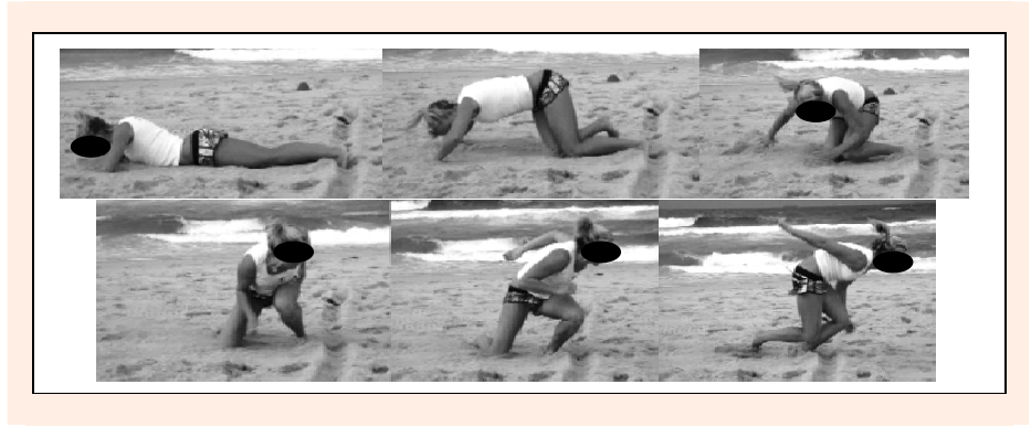
Figure 3. Sequence of a typical beach flags start for young adult sprinters.