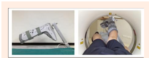
Figure 3. The rotational stability of involved and normal knee examined by the imitative Rotameter equipment in three-dimensional CT.

in 3, 6, and 12 months post-operatively, including the Lysholm score, Tegner score, and IKDC subjective score.