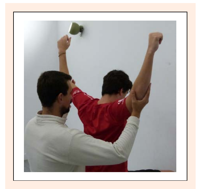
Figure1. Lat pull-down exercise with a personal trainer applying manual resistance.

Each session began with a standardized warm-up identical to the warm-up protocol of the testing sessions. Training for the CT group consisted of the bench press and lat pull-down exercises completing 3 sets of 8 repetitions performed with a controlled intensity of level 8 ("hard") on the 0-10 perceived exertion scale. A 60second rest interval was given between sets for passive recovery. Exercise cadence was controlled using a metronome programmed for 2-second concentric and 2-second eccentric phases. The MRT group performed the same movements with the same cadence and the same set/repetition/rest time scheme, but with an experienced and certified personal trainer applying manual resistance (Figures 1 and 2). This protocol was similar to that carried out by Vetter and Dorgo (2009) with highly fit dancers. The perceived exertion for the MRT group also targeted 8 on the 0-10 scale. In both groups, the resistance was adjusted if the level of perceived exertion was below or above 8.