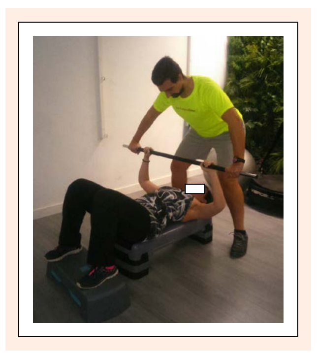
Figure 2. Bench press exercise with a personal trainer applying manual resistance.

tistical significance was set at p < 0.05. Effect size was estimated with Hedges g (Cooper et al., 2009). The following scale was used to categorize the magnitude of effect: < 0.2 = trivial; 0.2-0.5 = small; 0.5-0.8 = medium; 0.8-1.3 = large, and > 1.3 = very large. All variables are reported as mean \pm Standard Deviation (SD).