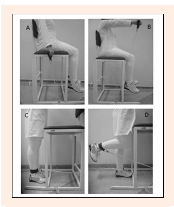
Figure 2. Execution of the exercise using elastic tubing. Upper quadrants: Elastic resistance training for Shoulder flexors from (A) resting position until (B) end of the movement. Lower quadrants: Elastic resistance training for the knee flexors from (C) resting position until (D) end of the movement.

was used for the upper limb training. One-legged open chain knee extension/flexion exercises were conducted on a sated position.