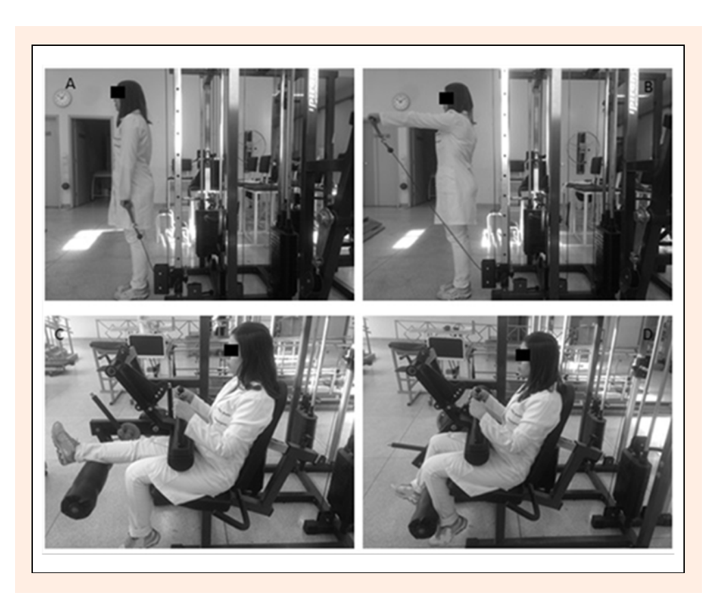
Figure 3. Execution of the exercise using weight machine. Upper quadrants: Conventional resistance training for Shoulder flexors from (A) resting position until (B) end of the movement. Lower quadrants: Conventional resistance for the knee flexors from (C) resting position until (D) end of the movement.