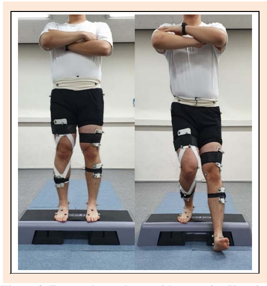
Figure 2. Forward step down with posterior X taping.