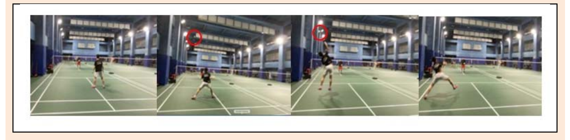
Figure 3. Experimental actions, hitting action (footwork and stroke shuttlecock).