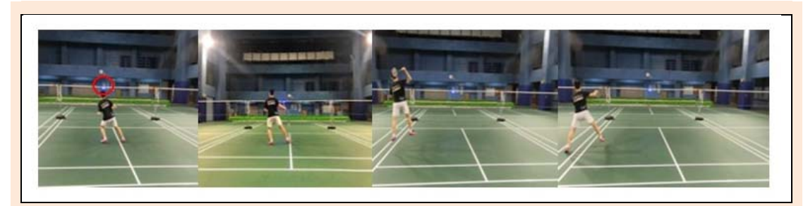
Figure 2. Experimental actions, shadow motion (footwork and racket swinging practice without targets).