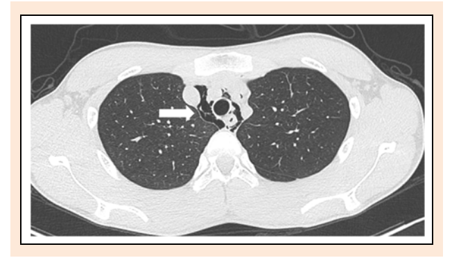
Figure 2. CT revealed extra-luminal gas within the mediastinum and soft tissue emphysema over the right upper chest and lower neck regions (white arrow).

SPM is observed in young people often without apparent precipitating factors or diseases. Previous studies