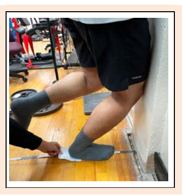
Figure 2. Knee to wall testing using a measuring tape.