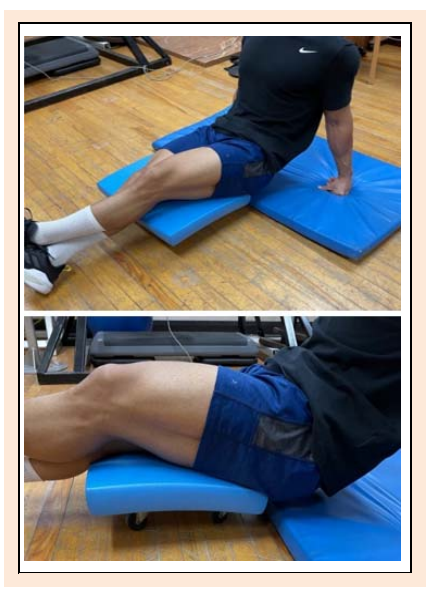
Figure 4. Participant performing sham rolling (SR) using a rolling board (dolly) with a foam pad on top to reduce pressure.