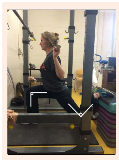
Figure 1. Intervention condition exercise: Down phase of a standardized Bulgarian split squat, demonstrating the 90° angles at both knee joints.

non-dominant leg (back foot) on an elevated step. The base of their patella determined the height of the step. A piece of clear hospital tape was placed on the ground, orthogonal to the step platform, to provide a guide for a narrow base for each participant. The participant then measured three-foot lengths away from the platform to standardize the placement of their dominant leg (front foot). A second piece of tape was placed on the ground to mark this spot. A complete squat was characterized by a 90° angle at both knee joints in the down phase of the squat (Figure 1). Each squat repetition (eccentric and concentric phases) was a duration of 5s. Participant 1 repetition maximum (RM) for this exercise was then estimated based on repetitions of submaximal resistance (LeSuer 1997). Participants did not perform more than 3 sets to estimate their 1RM. This predicted 1RM was then used to determine their 50%, 70%, and 90% 1RM weights.